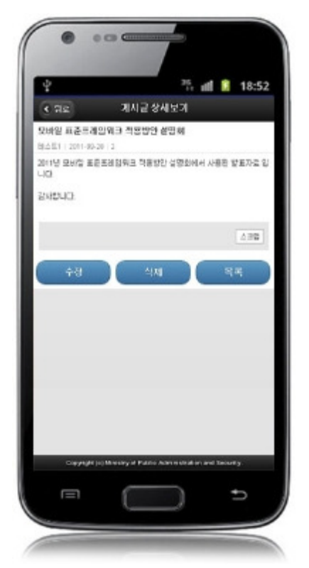
Scrap: Move to the scrap register screen to register the scrap

To register the scrap, the scrap button in provided in detailed inquiry screen on the general board, anonymous board, effective board and notice board.